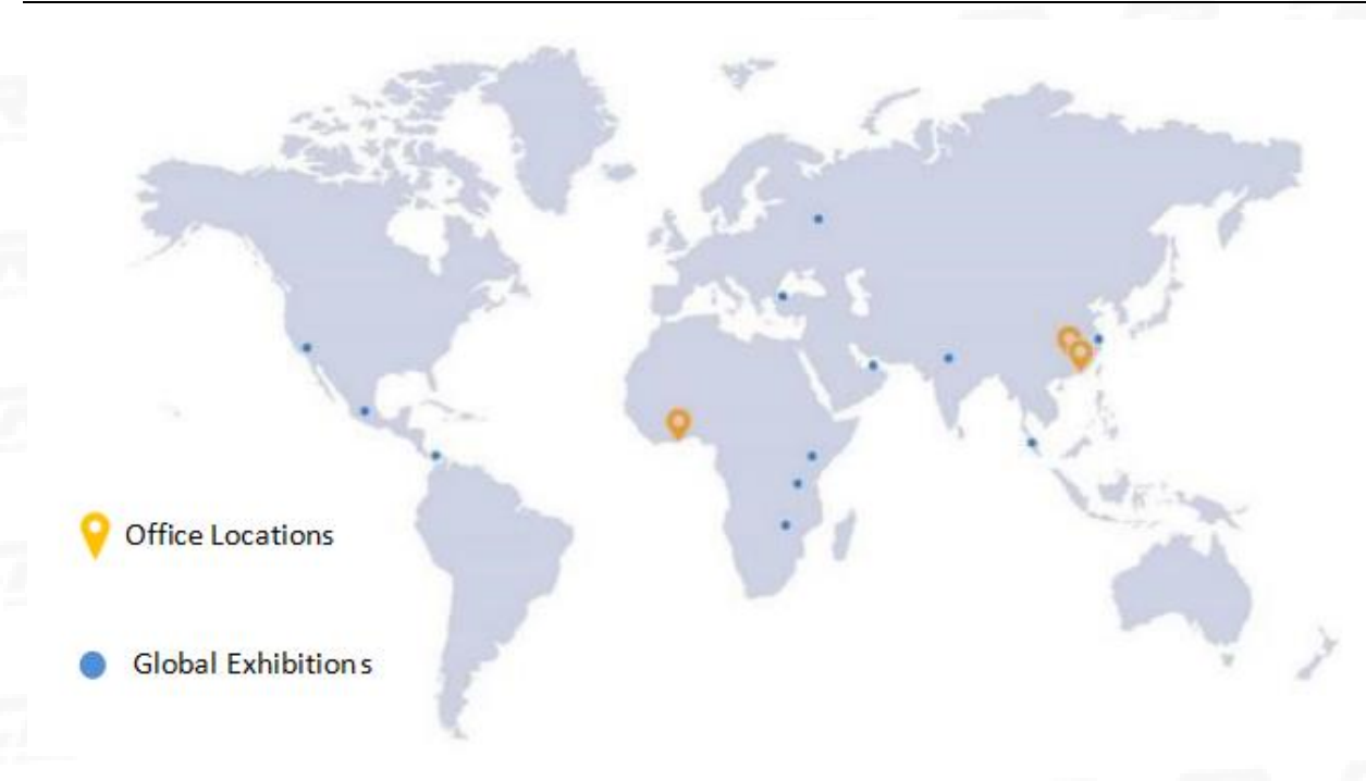
Pic No. 5